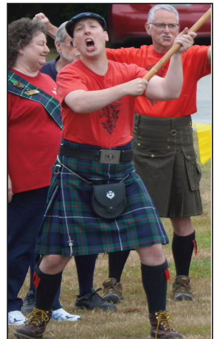
Donnachaidh clansmen, “fierce when roused.”

With good fortune, no one will be punching out anyone’s lights and we’ll all meet again at the 42nd Annual Maine Highland Games and Scottish Festival. And have another bonnie Scottish time.